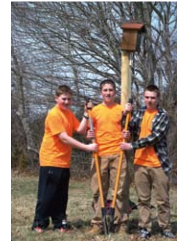
Jamestown Litter Corps puts up houses for kestrels and bluebirds.