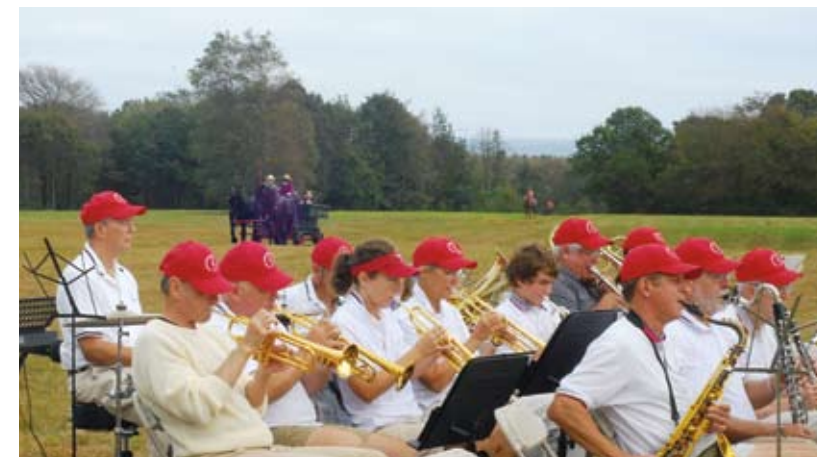
Hey Day visitors could listen to the Jamestown Community Band playing in an open field or take a wagon ride around Godena Farm.