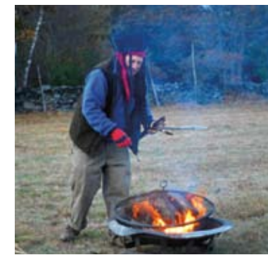
A pirate starts a fire for our Halloween event for children.