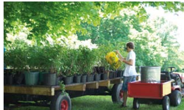
Watering more than 400 shrubs this summer. The shrubs will be planted on our walking trail.