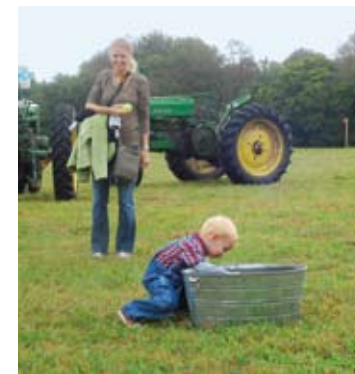
Sometimes the wonder of Hey Day is a boat in a metal tub.