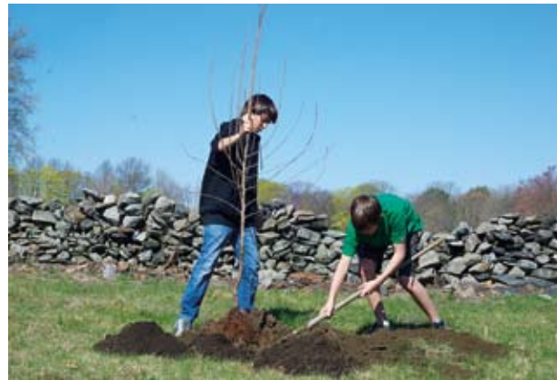
Planting apple trees in our new orchard.