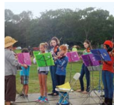
The Island Fiddlers playing during HeyDay.