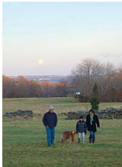
All are welcome to walk the fields at Godena Farm.