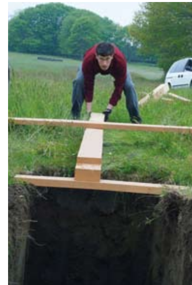
The grape arbor: laying a foundation.