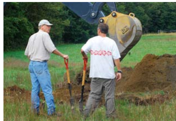
Two soil scientists work with a volunteer backhoe to dig soil pits for the New England Intercollegiate Soil Judging. A talk on island soils was also part of Hey Day.